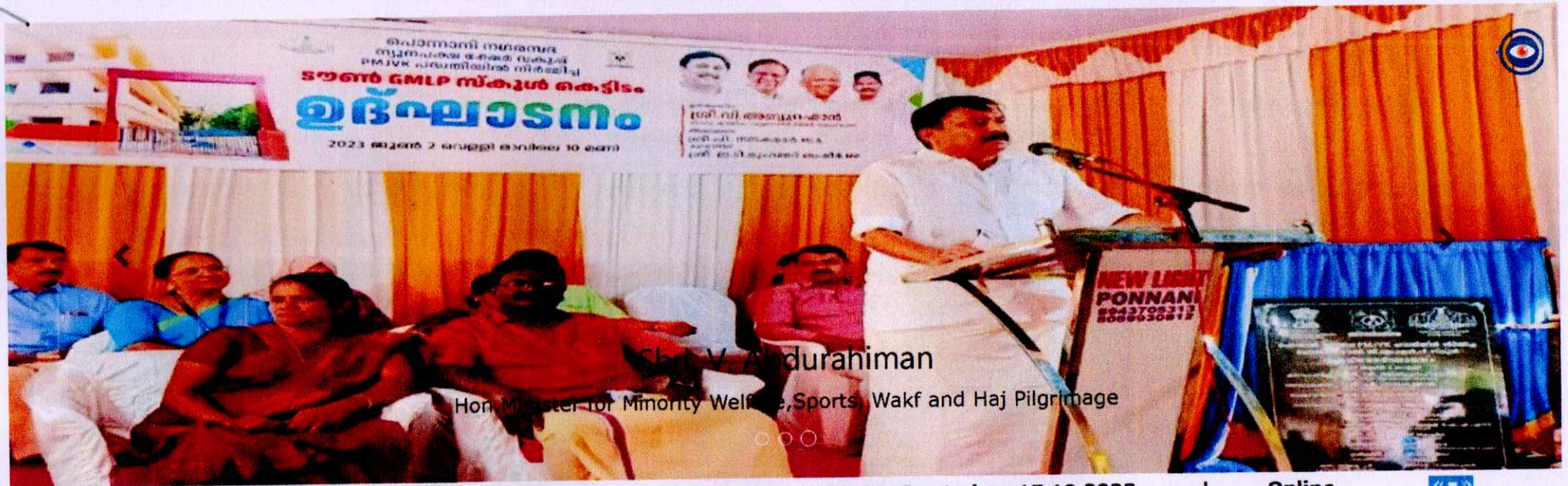
Shri V. Abdurahiman Hon. Minister for Minority Welfare, Sports, Wakf and Haj Pilgrimage

2023 | Application invited for UGC/CSIR-NET Coaching Centres 2023-24. Started on.17.10.2023 | Online Back To Top